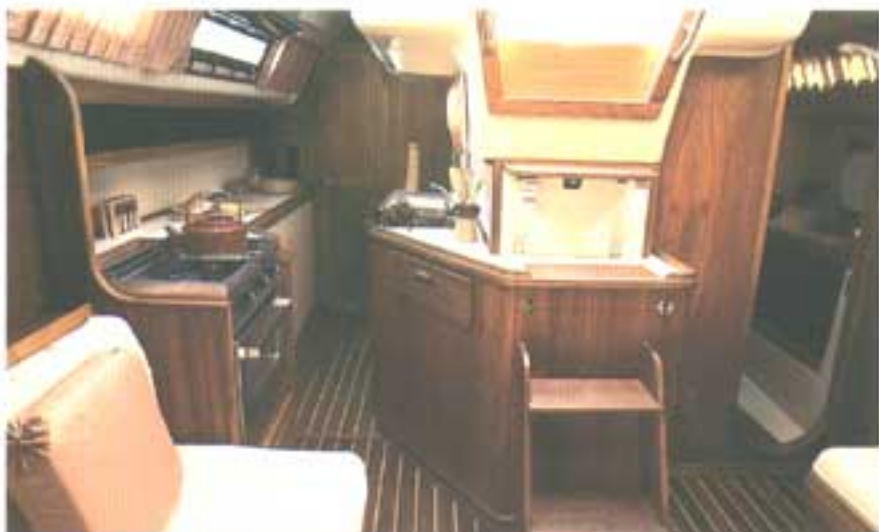
Unique dual access to aft stateroom ▼