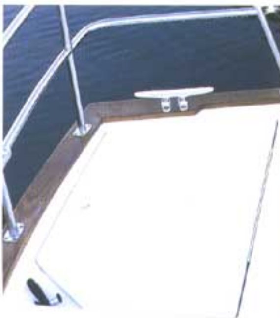
Huge lazaret provides generous deck storage plus a built-in freshwater shower.