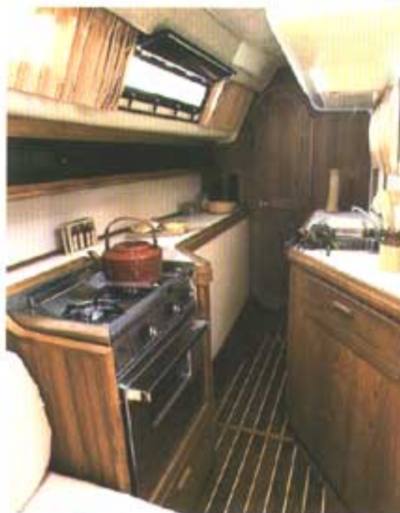
Large flow-through galley has over 10 feet of counter space, large icebox and generous storage.