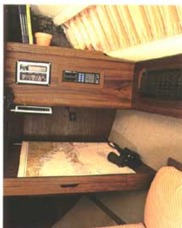
Navigation area includes easy access to instruments and all wiring in electrical panels.