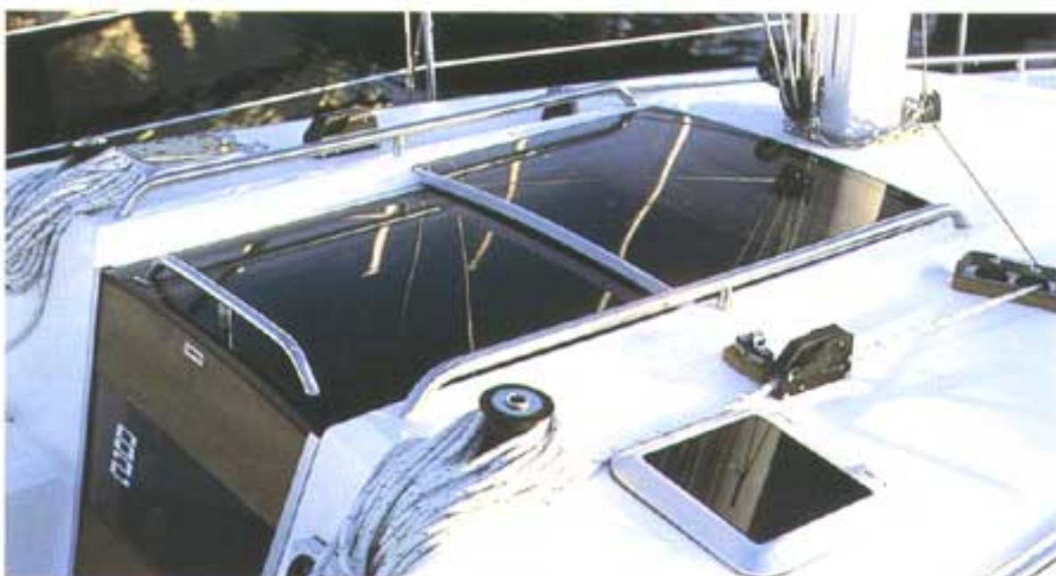
Custom S2 companionway acts as a skylight and provides generous ventilation. All sail controls lead aft to the cockpit.