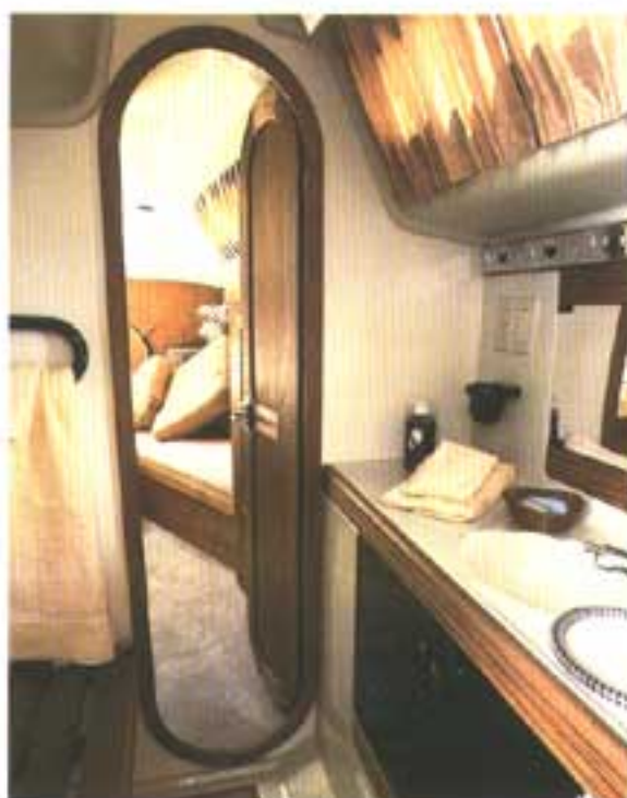
Spacious head features makeup lights over the vanity and a large teak bench for a sit-down shower.