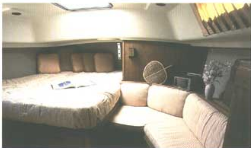
▲ Spacious aft cabin contains a queen size bed, L-shaped settee and two hanging lockers – one cedar-lined.